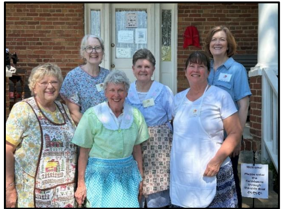
Historical Society members hosted the event