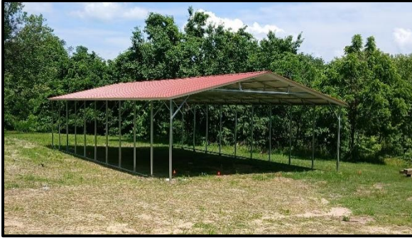
The new wagon shelter.

The Kinder Woodshop recently installed treated lumber along the bottom of both sides of the new shelter. The treated lumber will provide a protective barrier from the ground for the milled lumber that the Sawmill Club will cut and mount for the side walls of the shelter. This may take a bit of time as trees of suitable size for processing become available.