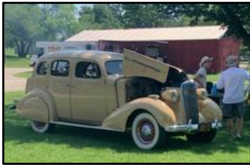
1936 Buick Special