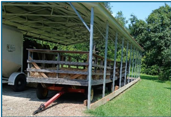
Note: Treated lumber installed along the side.

The Kinder Woodshop recently installed treated lumber along the bottom of both sides of the new shelter. The treated lumber will provide a protective barrier from the ground for the milled lumber that the Sawmill Club will cut and mount for the side walls of the shelter. This may take a bit of time as trees of suitable size for processing become available.