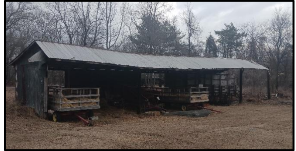
Old loafing shed shelter.

The loafing shed near the Youth Camping area next to the Perimeter Trail was the shelter for the two strawbale seated wagons used for hayrides at Kinder Farm Park. Late last year it was realized that the shed was in danger of collapsing in a strong wind. The wagons would be severely damaged if that happened.