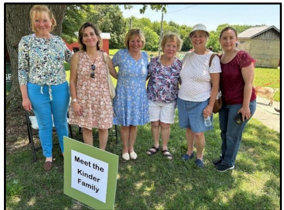
Visitors could meet with Kinder relatives

The celebration welcomed several hundred adults and children who endured the 90° heat to enjoy kids' games from the 1930's, try out antique typewriters, view an 1890's sewing machine, and a farm video. Cake and cookies were offered, and a food truck and snowball vendor were available.